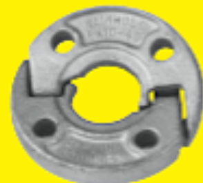
Divided flanged joints