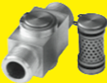
Filter Equipment for steam gases & fluids