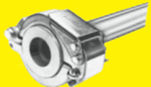
High pressure pipe couplings A & B