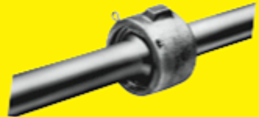
High pressure screw type couplings