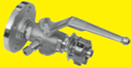
Steam valves with viton sealing ring