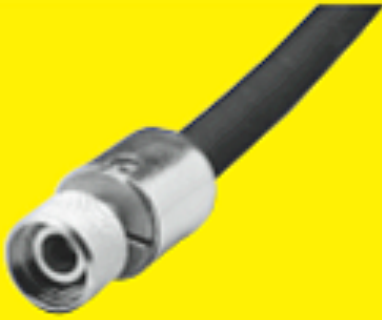
Two jaw band fittings for steam hoses