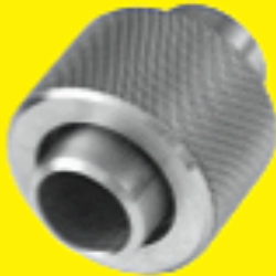
Union for steam & other fluids