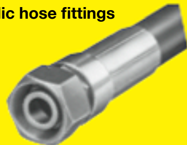
Hydraulic hose fittings